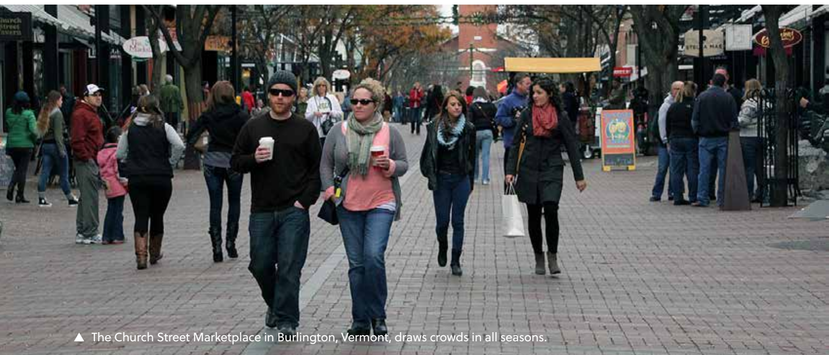
▲ The Church Street Marketplace in Burlington, Vermont, draws crowds in all seasons.