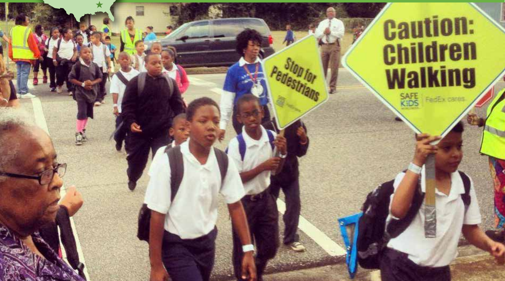
▲ Encouraging kids to walk to school has been one strategy to promote health in Birmingham.