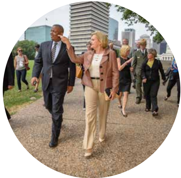
▲ Transportation Sec. Anthony Foxx (left) walks with Missouri Sen. Claire McCaskill to an event celebrating pedestrian improvements at the St. Louis Arch.