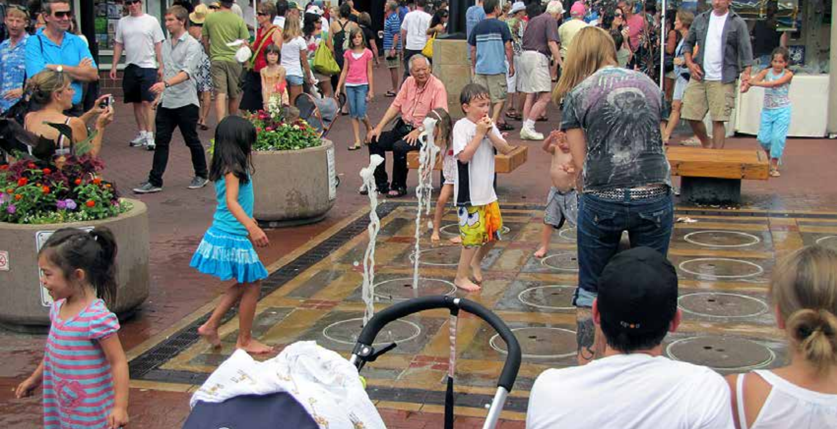
▲ Boulder's Pearl Street Mall is the heart of the community.