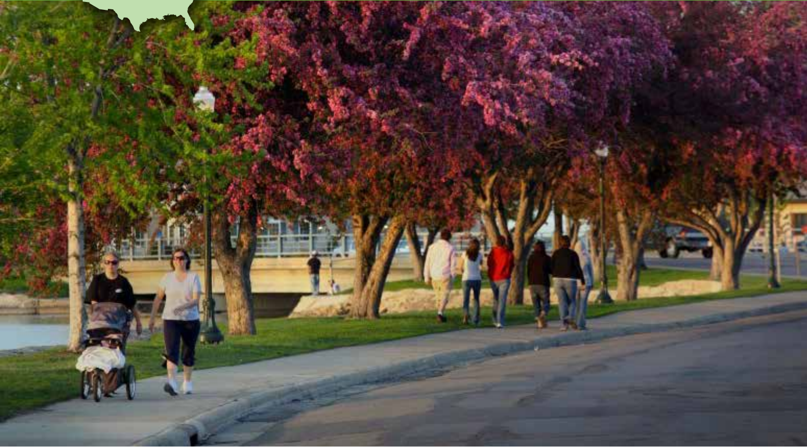
▲ The 5-mile Blue Zones Walkway around Fountain Lake Park brings out people all year round.