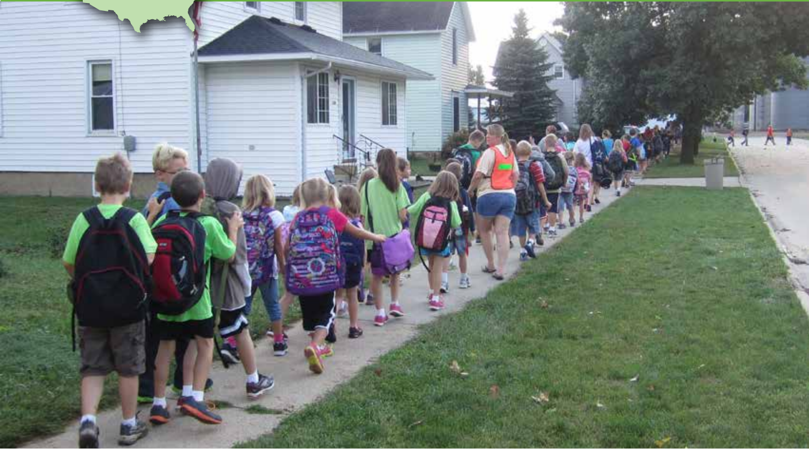
▲ A walking school bus gets kids to classes in Riceville, Iowa.