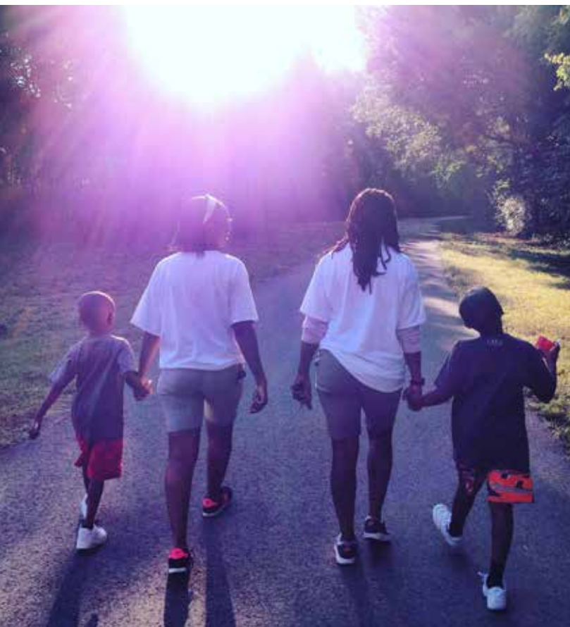
◀ The Enon Ridge Trail is one of the first links in a countywide greenway network.

Birmingham has many strong and committed people working to reframe, redesign and reenergize their community by partnering with many different types of organizations with complementary visions. Lakeshore Foundation is one of these groups, which wants to make sure that their members with disabilities and injured military veterans can benefit from the new trails by advocating for universal design and participating in these community initiatives.