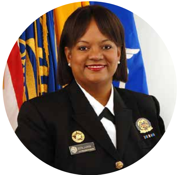
▲ Former Surgeon General Regina Benjamin built a walking path at her Alabama clinic to increase social interaction in the community.