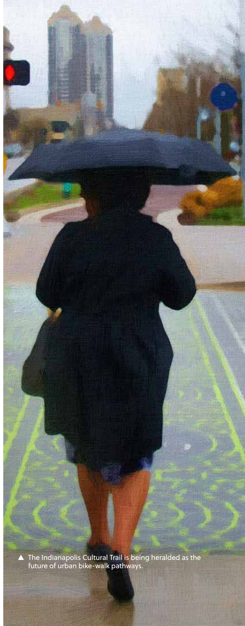
▲ The Indianapolis Cultural Trail is being heralded as the future of urban bike-walk pathways.