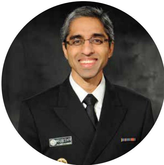
▲ US Surgeon General Vivek K. Murthy's Call to Action on Walking & Walkability encourages everyone to get up and take a walk.